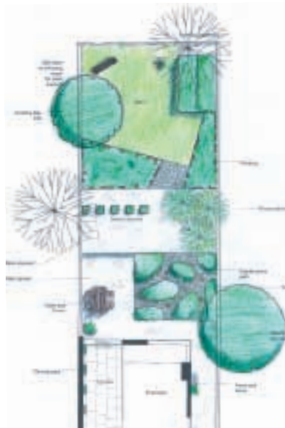
Plan and photographs of a Cleve West garden in London. This newly built contemporary family garden was designed to complement the modern glass extension built onto the house. The space is free from clutter and incorporates a herb garden, lawn area for the children and a garden shed with sedum roof.