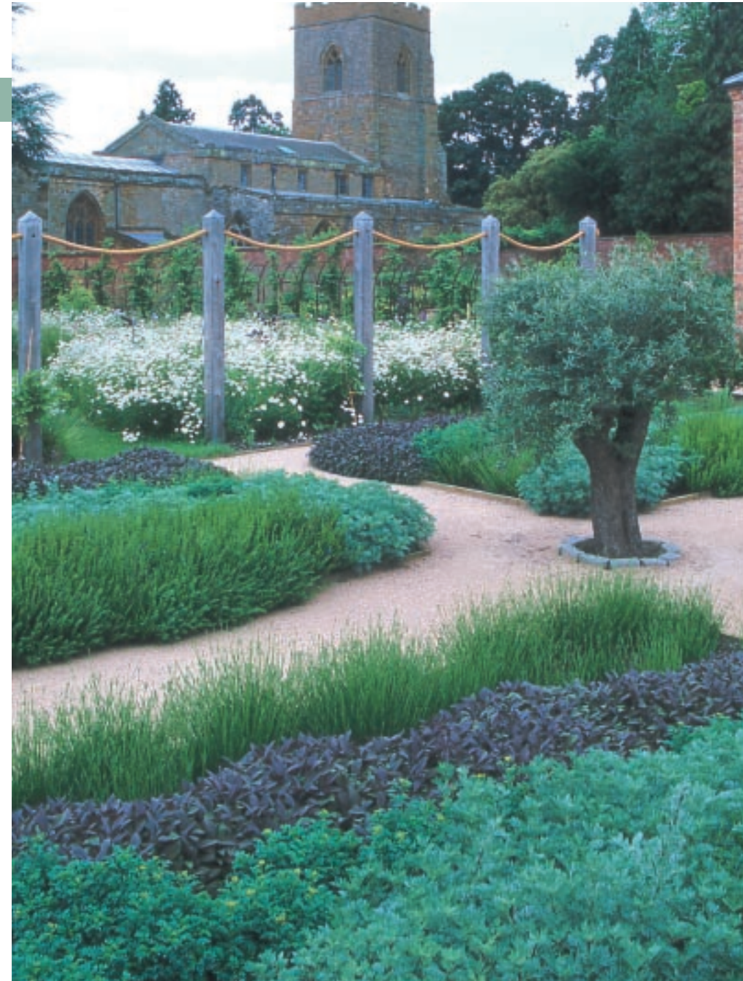
Left: A view into The Garden House, Northamptonshire (2000). The new-build villa house is set in a listed walled garden, so Blom's design needed to address the romantic nature of the house and bring the whole development together. A simple formal quartered design was created with blues, greys and whites the prominent colours.

The concept of the right plant in the right place is an important principle for Blom. She says: "Principally, I am a plantswoman and not only want the right plant for the environment, but also plants that suit the client. The planting scheme should be a continuing source of pleasure to my clients and their families long into the future."